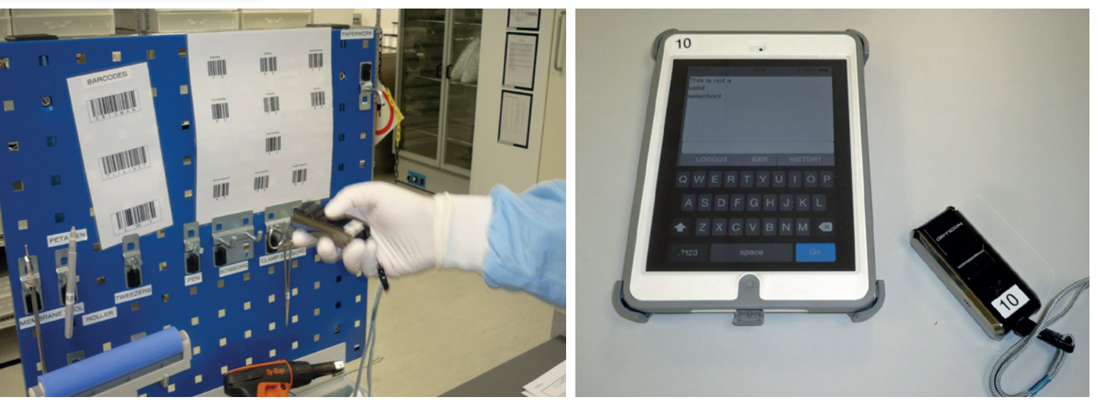
Left: Barcodes allow users to quick scan a relevant programme ready for data collection.